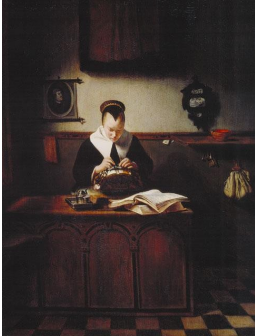
"Lacemaker 2" - N. Maes

The last day for items for the 'September 2023' Newsletter is: (Saturday) 2 nd September 2023 Please email to Ali Ongley at: aongley@yahoo.co.uk